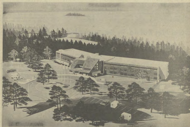
Radisson Inn Grand Portage Grand Portage Minn