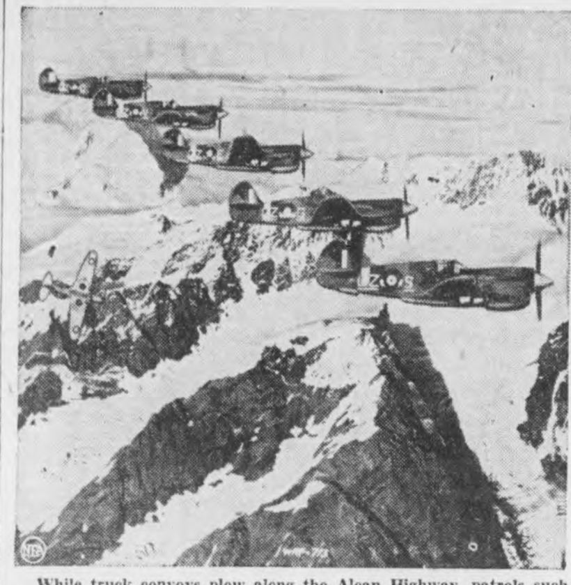
While truck convoys plow along the Alcan Highway, patrols such as this group of Canadian fighters maintain sky vigilance. The road was built to link up fields on the air route northward.

Aerial Fortune-Hunter Blazed Trail Selected for Army's Alcan Highway