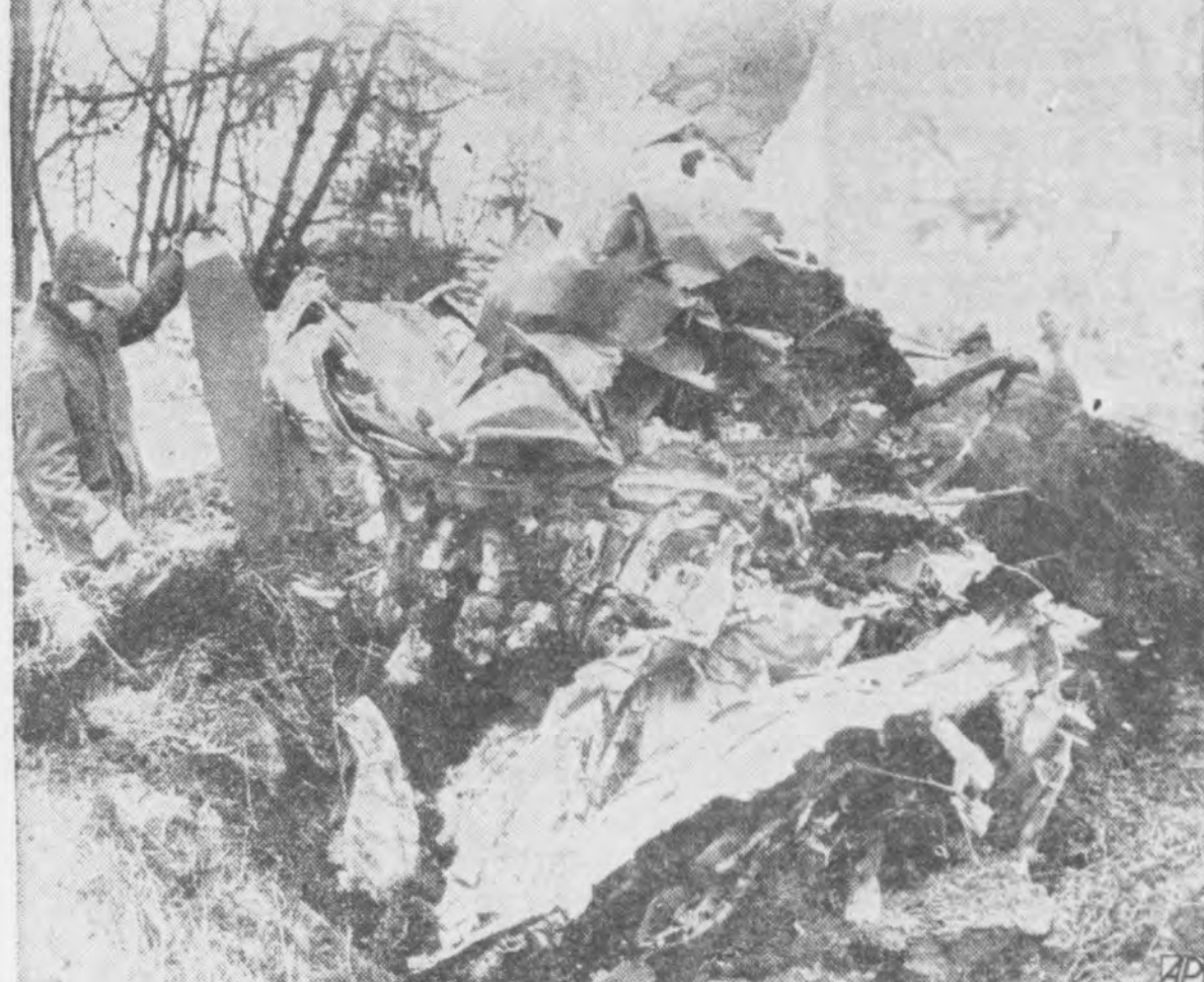
This tangled wreckage was an Army bomber, which crashed near Cottage Grove, Minn., eight minutes after taking off on a routine flight. The three crew members aboard perished. Witnesses said the the ground troops who now have bomber had been flying low, hit a high tension wire and crashed.