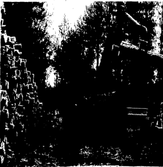
A lumber chiller works on separating lumber from the Copper Country and paper mill in Escanaba. The logs are separated by diameter and length.