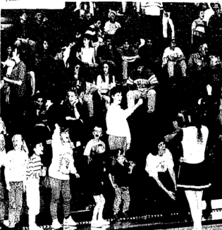
The Big Bay de Noc cheerleaders fire-up the crowd during their game against Manistique.