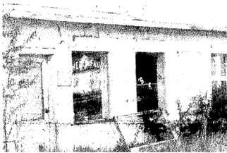
Jolly's old store in 1888

Matching funds are available to organizations for a variety of art related projects through a program offered through the CUPPAD Regional Commission, Escanaba. Deadline for applying for the grant funds is October 8, for projects that will begin between Feb. 1, 1994 and May 30, 1994. The project must end by Sept. 30, 1994. The money may be used for exhibits, festivals, workshops and classes. A maximum of $2,000 is available to an organization. For more information, call 786-9234 to request an application packet.