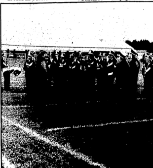
The Manistique High School Marching Band prepares to fire up the crowd at a recent football game. The band played the Manistique fight song as the Emeralds took the field to play the game.