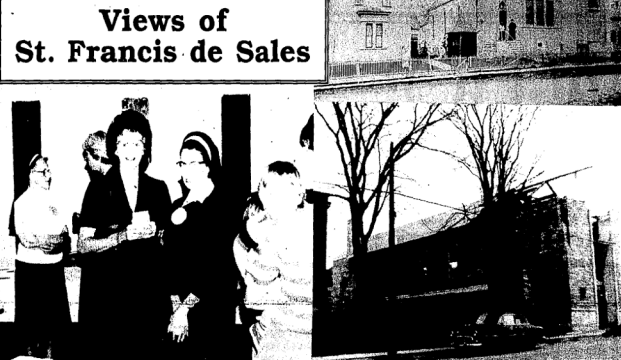
Views of St. Francis de Sales