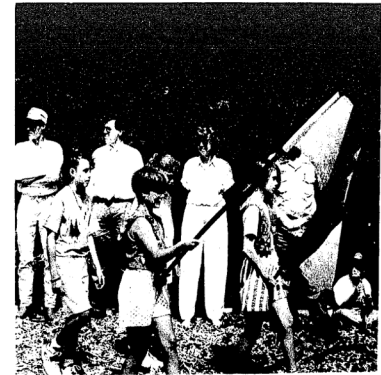
The Manistique Area Girl Scouts posted the U.S. flag and the Girl Scouts of America flag to get the open ceremonies started.