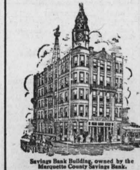
Savings Bank Building, owned by the Marquette County Savings Bank.

Marquette County Savings Bank Small Regular Savings Bring Wonderful Results