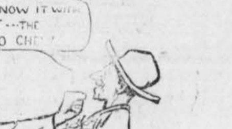
THE GOOD JUDGE AND THE FLORIST.

Do you know the rich, pure tobacco flavor? Chew "Right-Cut"—the Real Tobacco Chew. It's a new blend of ripe, mellow, sappy leaf. Seasoned, then sweetened just enough.