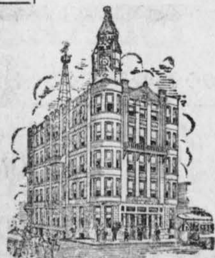
Savings Bank Building, owned by Marquette County Savings Bank.

We pay 3% interest on all sums left three full calendar months. Deposits made on or before the 5th of any month draw interest from the 1st of the same month.