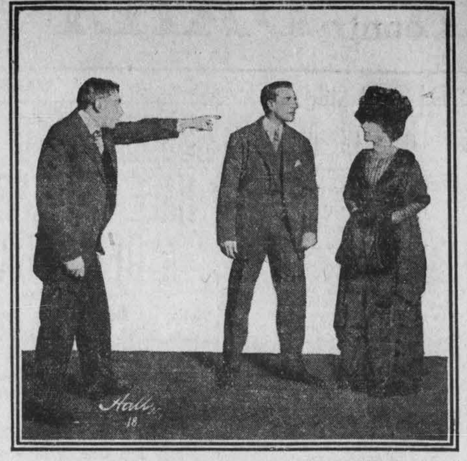
and it is eleven centuries older than Scene from "THE CITY," Shuberts' Great Play, at the Ishpeming Theatre To-Night.

"'Goodness knows,' answered the cob- had it thrust upon her.