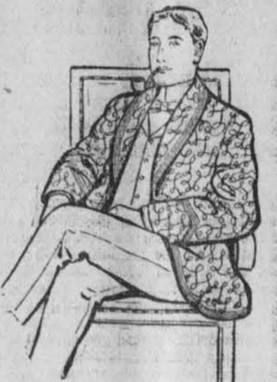
The Solid Comfort

and luxury that any man can derive from a Smoking Jacket makes it the happiest gift selection that can be chosen. Our holiday exhibit is of interest to all from its variety in rich designs, fabrics and price range.