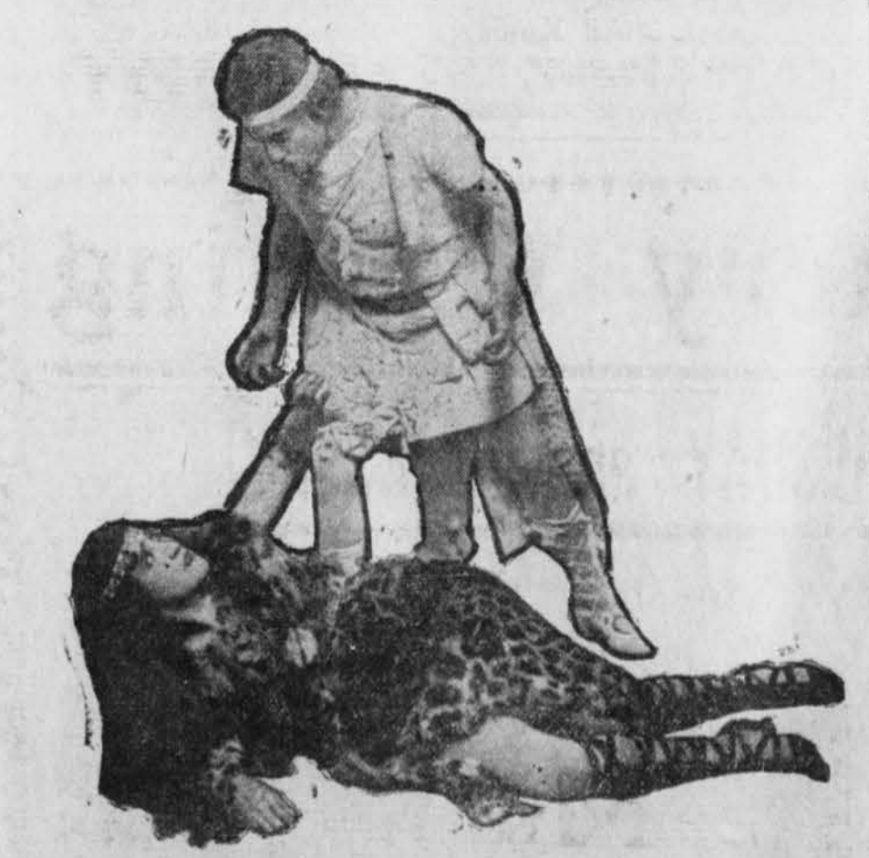
Scene from "Parsifal," at the Marquette Opera House TONIGHT:

Salary Is $75,000, But Nothing Is Allowed for Travel.