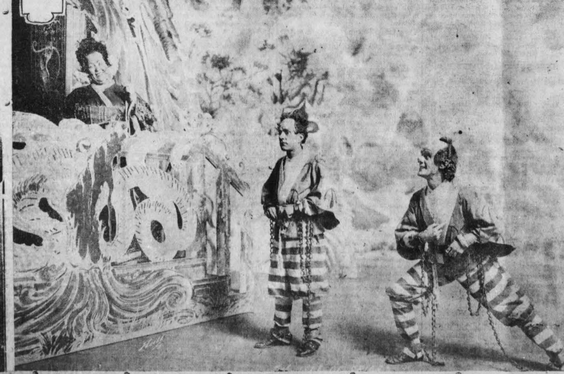
Scene in "Isle of Spice," at the Ishpeming Theatre Tonight.