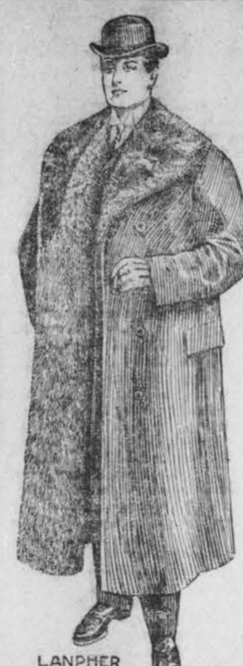
LAMPHER FUR LINED COAT

Marquette has dairies old and dairies new, dairies large and dairies small, but Vandenberg's dairy leads them all. Both Phones. (11-6-1w)