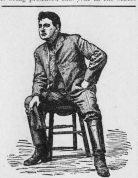
for the first time, and it has everywhere scored the biggest kind of a success.

"THE MANXMAN" TONIGHT. James O'Neil Will Be Seen Here in Hall Caine's Great Play.