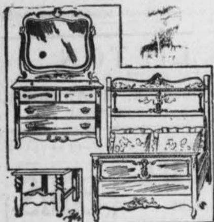
Chamber Suites from $18 50 up.