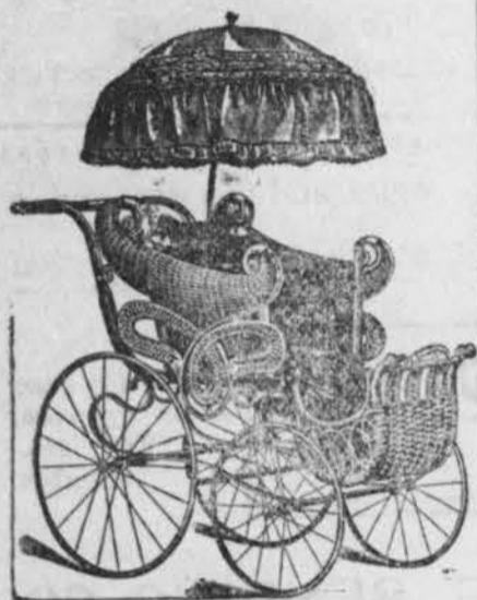
Go Carts from $3.00 up.