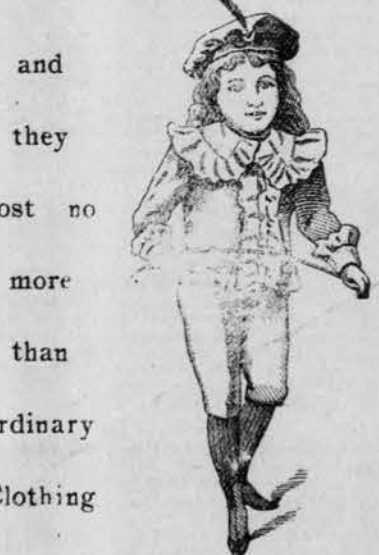
"A Mrs. Hopkins Boy."

and they cost no more than ordinary Clothing