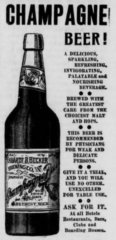
The Ekhardt & Becker Brewing Co., Telephone 1011. DETROIT, MICH.