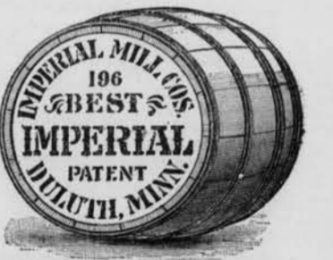
Buy the Celebrated DULUTH Imperial Flour