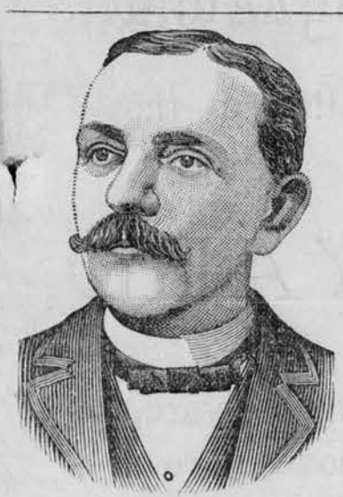
AN OPEN LETTER

WIFT SPECIFIC Co., Drawer 3, Atlanta, Ga.