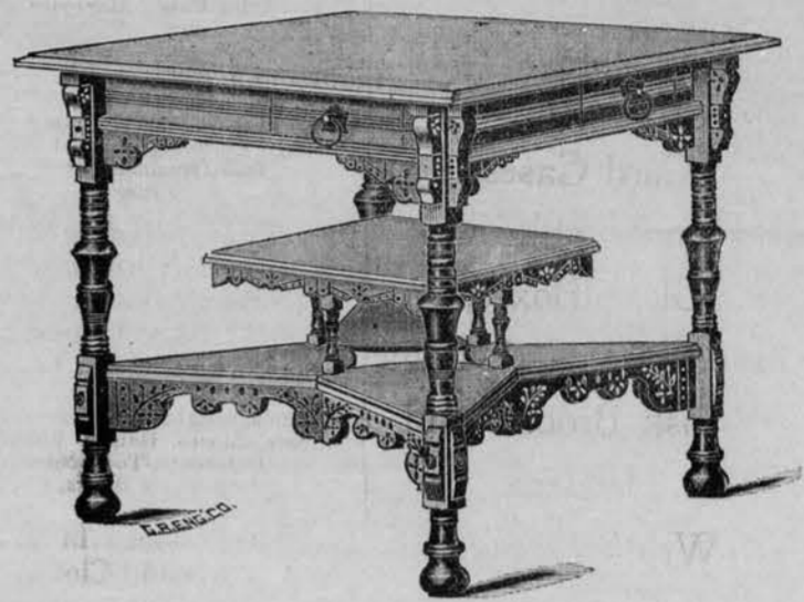
ONE MINUTE'S WORK FROM THE CHAIR. HAGER & JOHNSON'S PATENT.

WATSON & PALMER'S SHOES! In America. Just Arrived at WATSON & PALMER.