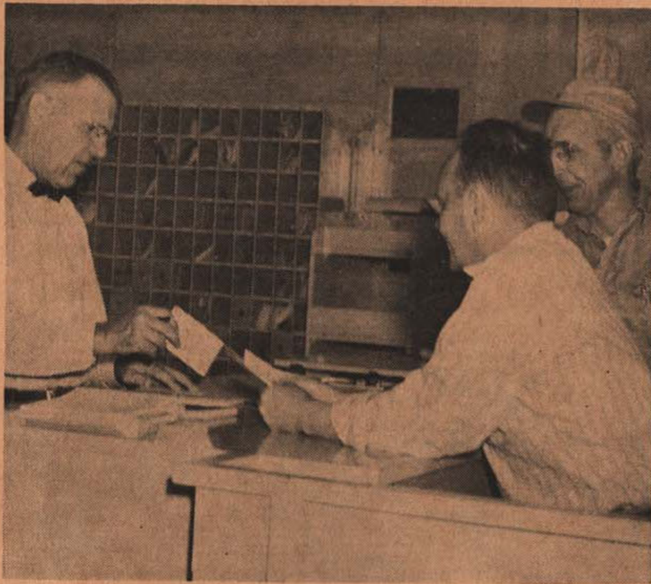
New counter high cabinets in lobby