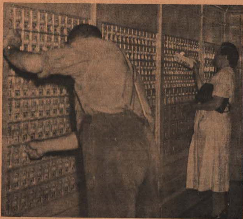
The new post office has 428 lock boxes