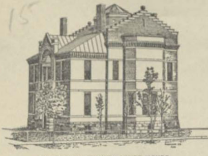
ONTONAGON COUNTY COURT HOUSE.